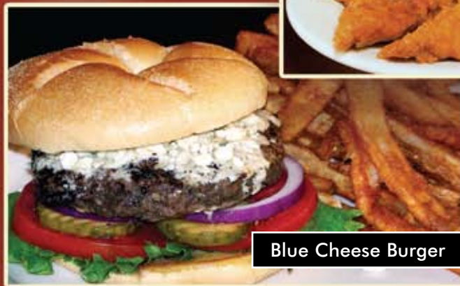
Blue Cheese Burger