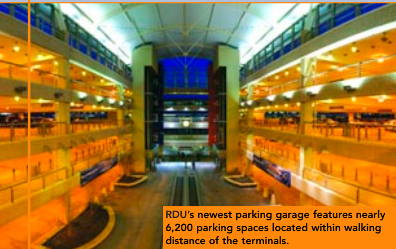
RDU's newest parking garage features nearly 6,200 parking spaces located within walking distance of the terminals.

When the airport began designing a new operations center, the structure was defined as an office space for Airport Authority employees. Therefore, the building needed to reflect similar characteristics as those used in the Airport