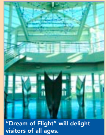
"Dream of Flight" will delight visitors of all ages.

With the general aviation terminal scheduled to open later this spring, the community will have the opportunity to view "Dream of Flight" and reflect on the first 100 years of human flight and the future of our travel in the sky above.