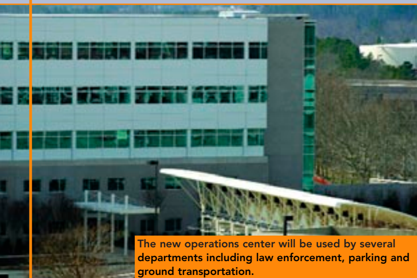
The new operations center will be used by several departments including law enforcement, parking and ground transportation.