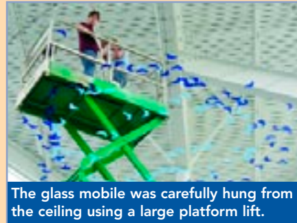
The glass mobile was carefully hung from the ceiling using a large platform lift.

installation of the frame took approximately 12 hours with three people working together. Pulleys were mounted to the building's structure prior to assembly of the frame and were used to hoist the frame up to the mounting location where it was bolted into place.