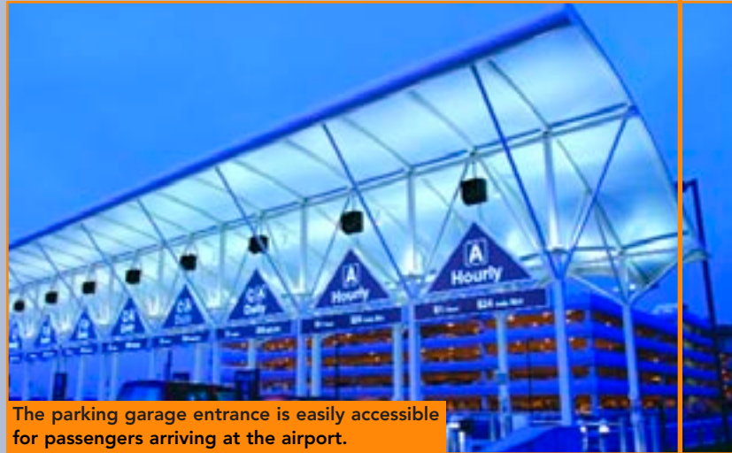
The parking garage entrance is easily accessible for passengers arriving at the airport.

The way you see RDU today is the result of efforts spent balancing the form and function of the airport's built environment. As the airport continues to evolve, it is the flexibility and foresight of the various project teams that will make RDU an airport for the ages.