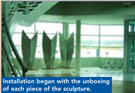
Installation began with the unboxing of each piece of the sculpture.