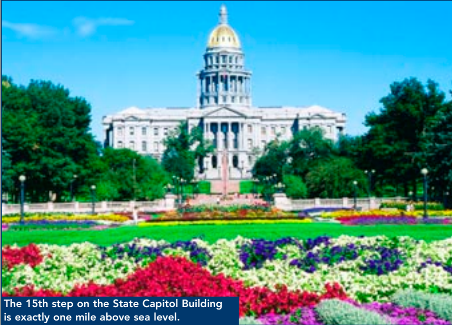
The 15th step on the State Capitol Building is exactly one mile above sea level.