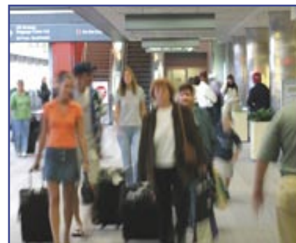
More than 300,000 people are expected to travel through RDU each holiday period.

Holiday helpers will be stationed throughout the terminals and parking areas on these days to assist travelers.